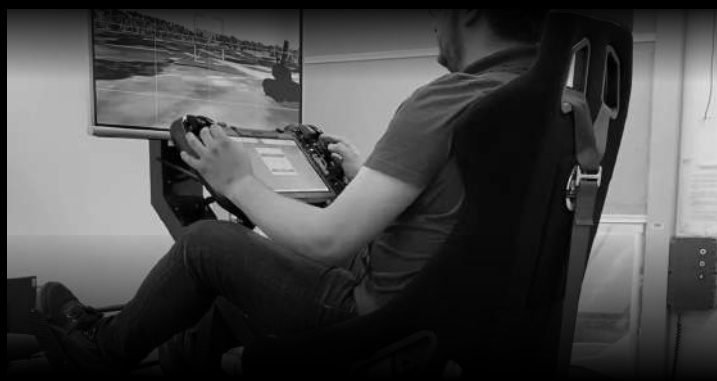
Cockpit with IKA-CTRL