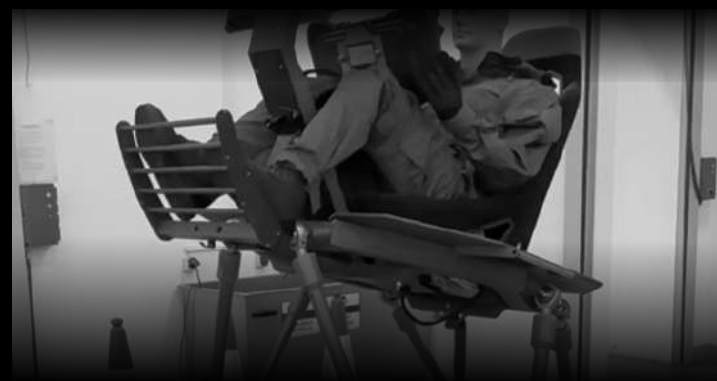
Wide 6DOF motion range