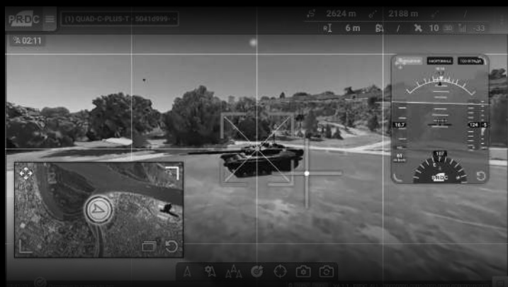
Enables precision aircraft control